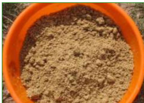
Insecticide bait with rice bran + Jaggery + water

Insecticides (Emamectin benzoate 5 SG, lufenuron 5 EC, novaluron 10 EC,) baits were prepared with rice bran + jaggery + water, against S.litura on FCV tobacco. Emamectin benzoate bait treated plots recorded least infestation both at 4 (4.60 %) and 10 (4.80 %)