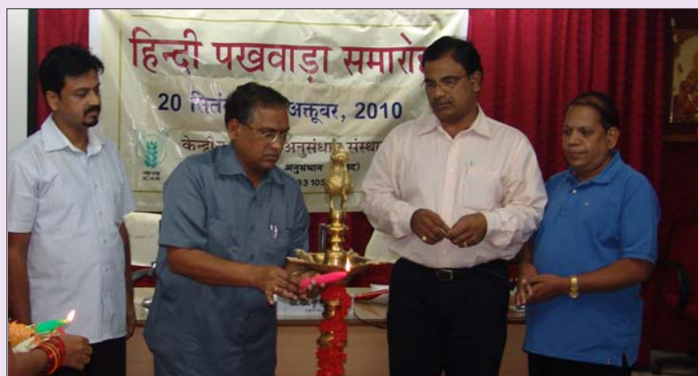
Inauguration of Hindi Fortnight Celebrations on 20.09.2010