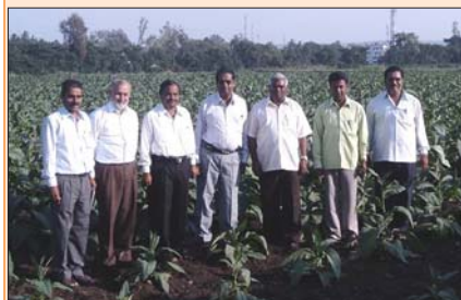
DG, ICAR visiting Bidi tobacco trial at ARS, Nipani