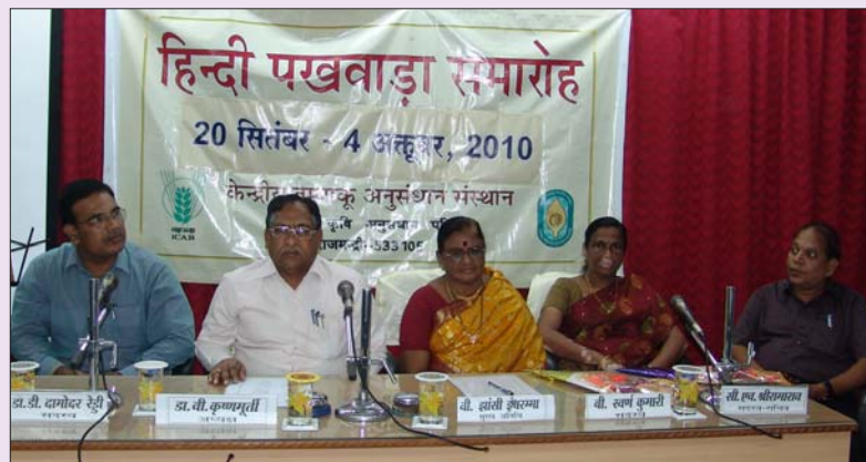
Valedictory function of Hindi Fortnight Celebrations on 07.10.2010