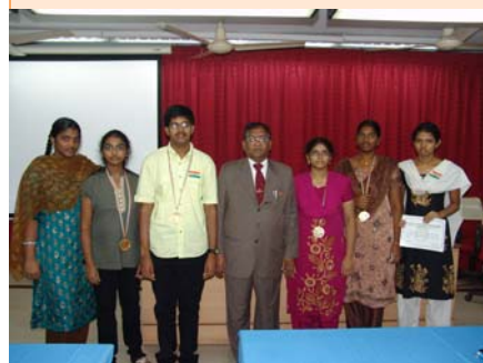
Director with the students who won CTRI ECCS Medals