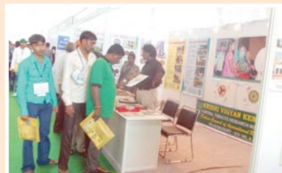
KVK exhibition stall at Gandhinagar, Gujarat