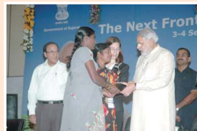
KVK beneficiaries Awarded by Hon'ble Chief Minister, Gujarat

KVK exhibits were displayed in the exhibition arranged at Gandhinagar Gujarat during 3-4 September, 2012. Two women entrepreneurs identified by CTRI KVK who established Coir and Leaf Cup making units were awarded by the Hon'ble Chief Minister of Gujarat State.